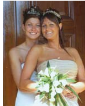
Left: Sharing the spotlight – Pink Wedding’s dual aisle concept allows both women to walk down the aisle and be given away