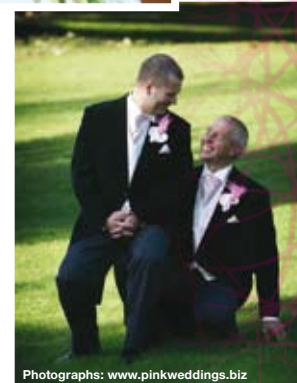
Right: In the pink – be inspired and make the day truly your own