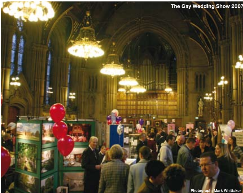
The Gay Wedding Show 2007